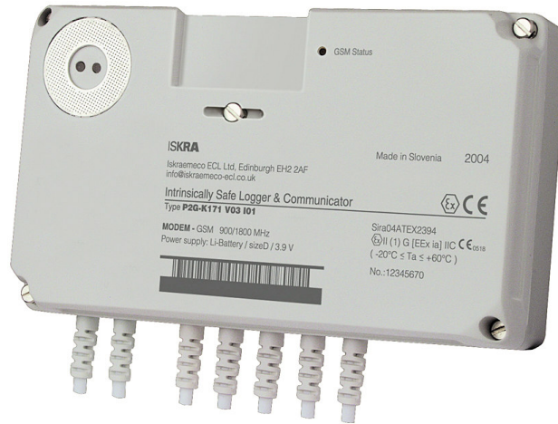
Figure 3-1: P2G Data Logger

P2G integrates a data logger, GSM module and safety isolations in a single unit. The internal GSM module provides a reliable means to communicate data as a part of an AMR, energy management or monitoring system for industrial gas, electricity and water metering. P2G belongs to a new generation of Iskraemeco professional communicators. The gas communicator is approved and manufactured in compliance with the BS EN 60079 and ISO 9001 and designed conform to Iskraemeco's own stringent internal standards derived from extensive field and manufacturing experience.