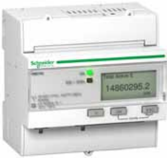
Energy Meter Series iEM3100