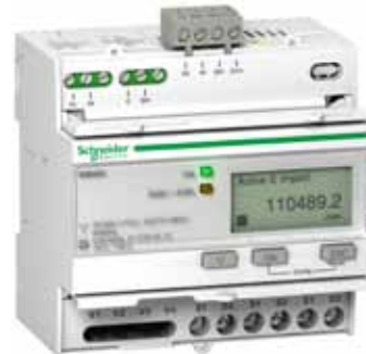
Energy Meter Series iEM3255